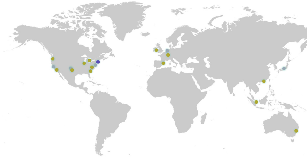
Packet's global locations cover all the key regions where PubNative needs local presence

With the clock ticking, the project had to be completed quickly – and it was. From the initial kick-off meeting to the first cluster going live with production traffic was a timespan of just three months.